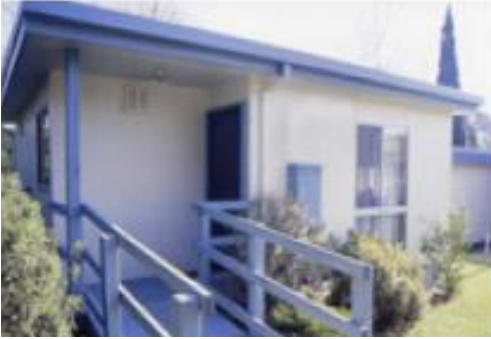
A typical movable unit provided by the Victorian Government

The waiting time for Movable Units is approximately 3-6 months and all connections such as sewerage, electricity and gas are supplied at no charge by the Office of Housing.