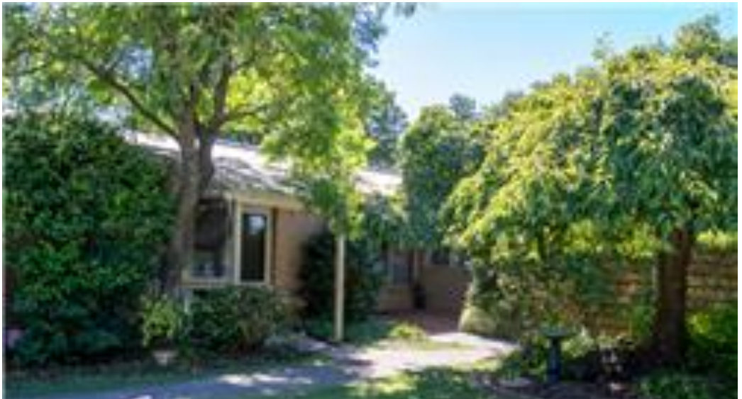
An Abbeyfield home in Melbourne.

Leases are offered under the residential tenancies act