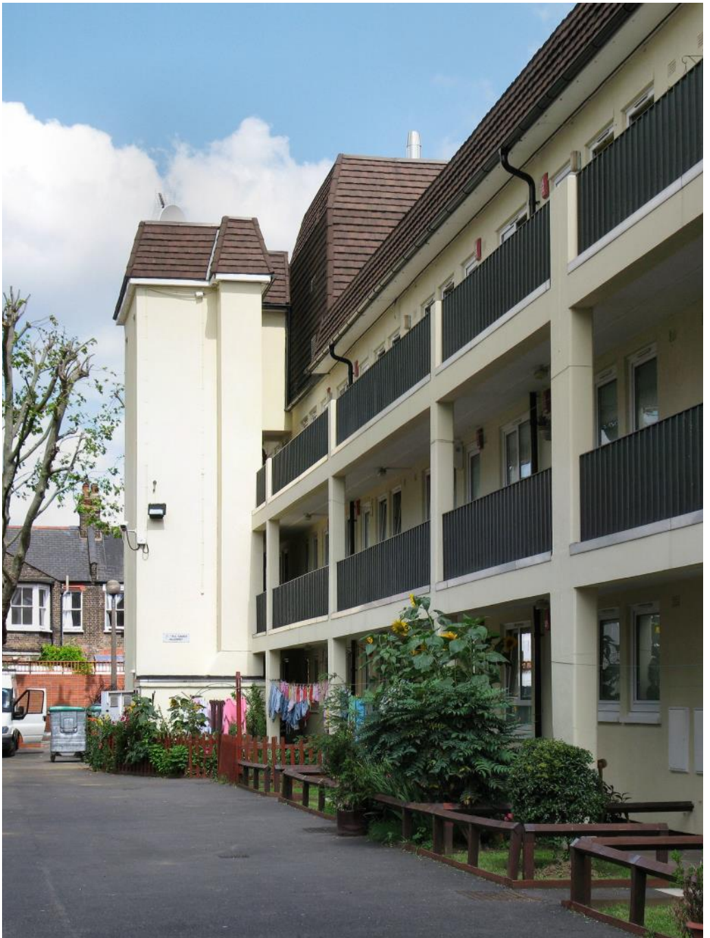
A housing cooperative building with a sunflower growing in the community garden out the front.