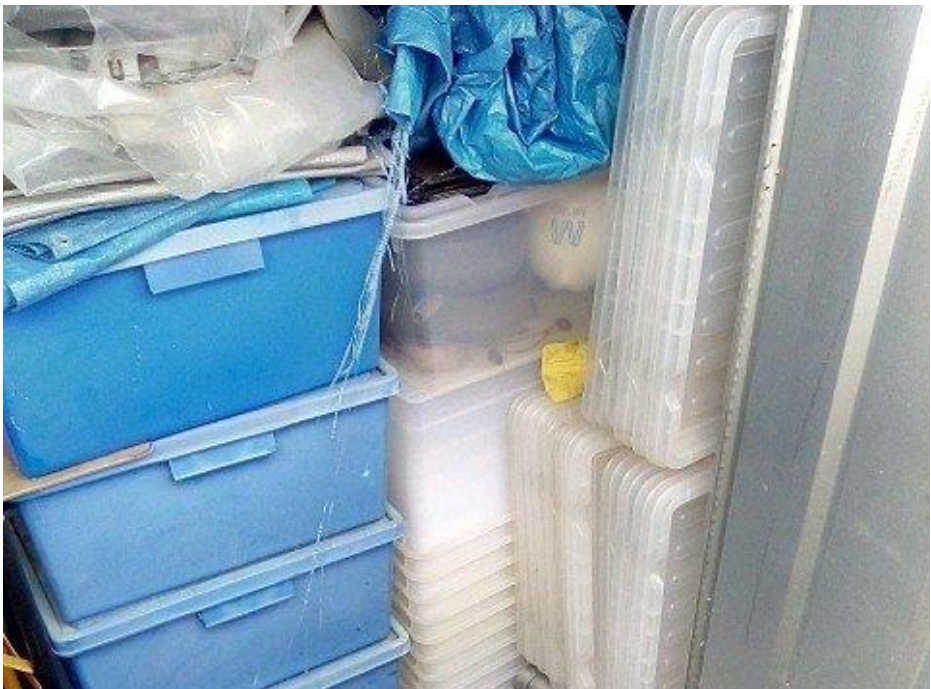
An older person living in a private rental house keeps plastic storage containers ready for if they are told they have to move

For most of us, we don't want to keep moving around all the time. If you need the security of a place you can stay for as long as you want, you can look at the 'how long can you stay' box at the bottom of each page.